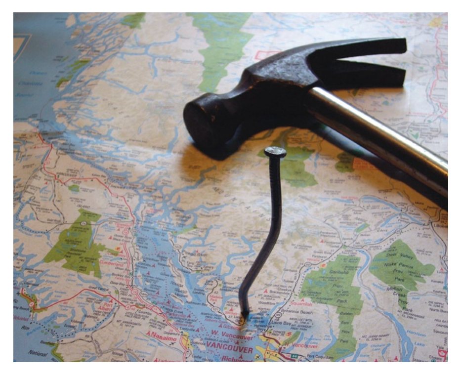
Figure 4 One cannot compromise on the relative positional integrity of RTN CORS

It is no surprise that Height Modernization initiatives, particularly those